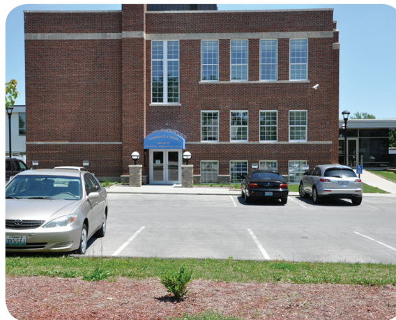
Grandview C-4 School District Central Office. Located at 13015 10th Street, Grandview. Phone: 816.316.5000.