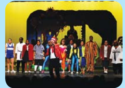
Seussical at GHS, one of three high school shows selected to perform at the 2010 MO Thespians Conference.

The November, 2009 Grandview High School production of Seussical the Musical was one of three high school shows selected to perform at the Missouri Thespians Conference held on January 7-9, 2010 at the University of Missouri – St. Louis (UMSL). The production took place on the Touhill Stage