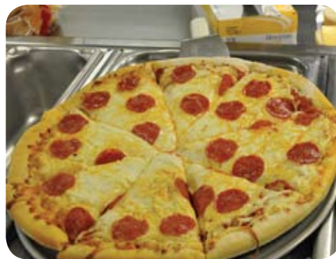
Sodexo, contracted for GC-4 Nutrition Services, offers fresh pizza each day at Grandview Middle & Grandview High School.