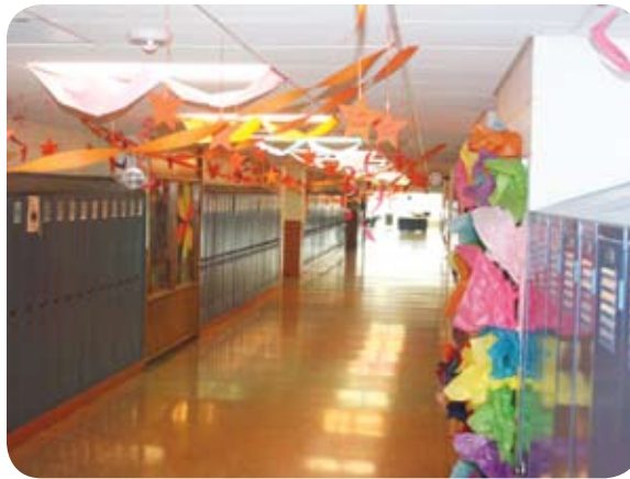
GHS SLCs show their school spirit with their participation in a school decorating competition during the 2009 Homecoming week.