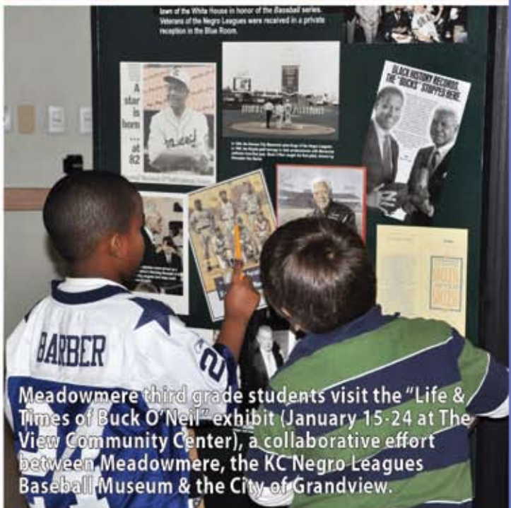
Meadowmere third grade students visit the "Life & Times of Buck O'Neil" exhibit (January 15-24 at The View Community Center), a collaborative effort between Meadowmere, the KC Negro Leagues Baseball Museum & the City of Grandview.