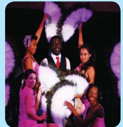
A scene from the GHS production of "Chicago The Musical" (November 18-20, 2010).

Grandview High School Theatre presented their first production of the 2010-11 season, Chicago The Musical (the hit Broadway musical), on November 18-20, 2010. The remaining season will include A Year With Frog and Toad (a musical based on the Frog and Toad children's stories- February 17-19, 2011), Proposals (A nostalgic memory play by Neil Simon- April 13-16, 2011) and a Student Directed Play on May 12,