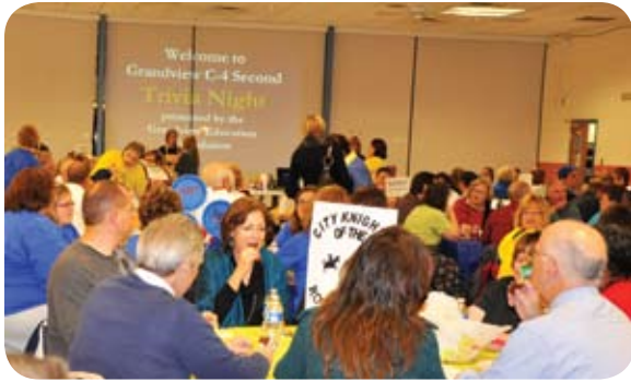
Grandview C-4 Trivia Night (November 11, 2010), hosted by the Grandview Education Foundation (GEF), featured 32 teams.