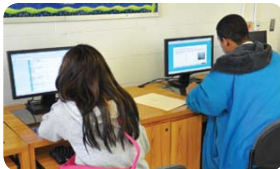
The GHS Virtual Academy program, initiated at the beginning of the 2010-11 school, year provides online learning for students.