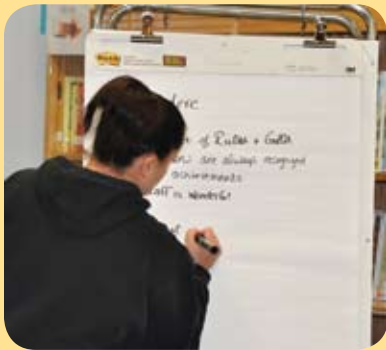
Discussion group school & district question responses are recorded by a parent attending the Belvidere Community Input Meeting on December 6, 2010.

As a part of the efforts to continuously improve student performance, the district conducted Community Input Meetings (taking place in November and December, 2010) with parents at each school to discuss findings from the Missouri School Improvement Program (MSIP) Advanced Questionnaire. Attendees also responded individually and in discussion