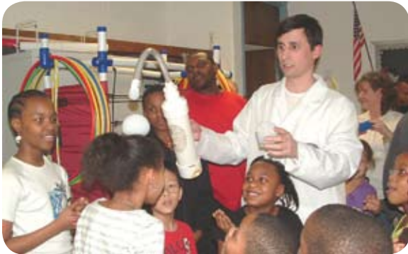
Students participate in dry ice experiments at the Meadowmere "PTA Science Sensation Night" held on February 17.

Meadowmere Elementary hosted its first PTA Science Sensation Night February 17, from 6:30 to 8:30 pm. The evening offered everyone the opportunity to learn more about science by participating in fun hands-on activities. Events included Volts and Jolts (a 45 minute show from Kansas City's Science City), Racing Rockets Station (loading and launching rockets),