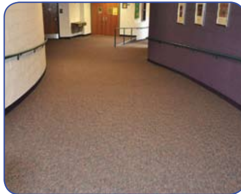
Meadowmere and Butcher-Greene Elementary carpeting projects. Funded by the 2007 bond issue and completed in 2010.