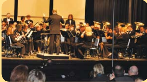
The GHS Symphonic Band performing with the Northwinds Symphonic Band in the GHS Auditorium on February 27.