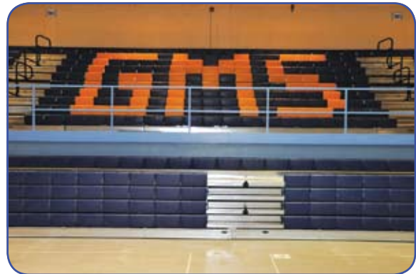
Grandview Middle School gymnasium bleacher replacement project. Funded by the 2007 bond issue and completed in 2010.