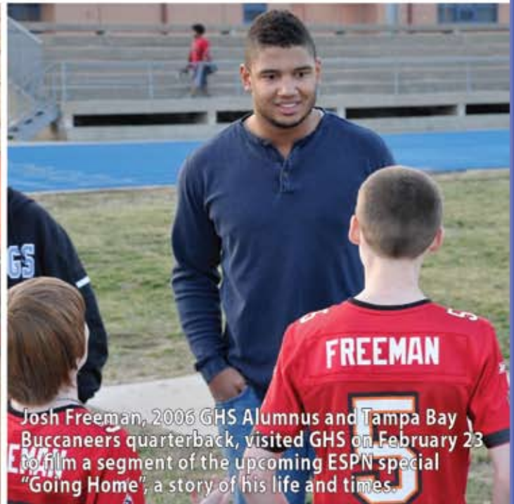
Josh Freeman, 2006 GHS Alumnus and Tampa Bay Buccaneers quarterback, visited GHS on February 23 to film a segment of the upcoming ESPN special "Going Home", a story of his life and times.