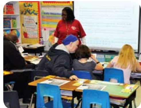
Parents and students attending the "MAP and Me Workshop" held on March 1 at the Belvidere Elementary Literacy Family Fun Night event.

—Help your student avoid "test anxiety." Students should be concerned about doing well on a test, but developing "test anxiety" can cause them to lose confidence in their abilities.