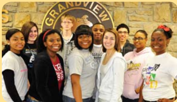
GHS Debate and Forensics squad members, honor recipients at the 2011 Suburban Conference held on February 19-20.