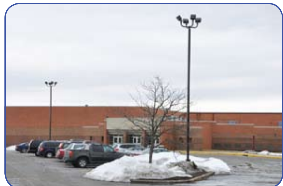
Grandview High School parking lot security lighting installation. Funded by the 2007 bond issue and completed in 2010.