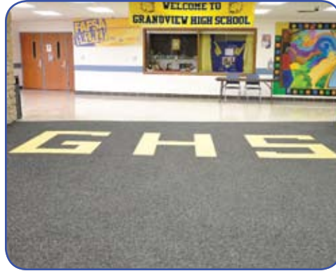
Grandview High School front entrance, which includes foyer window replacement and entrance carpeting. Funded by the 2007 bond issue and completed in 2010.