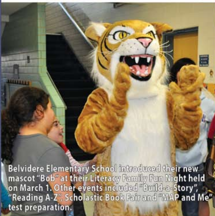
Belvidere Elementary School introduced their new mascot "Bob" at their Literacy Family Fun Night held on March 1. Other events included "Build-a-Story", "Reading A-Z", Scholastic Book Fair and "MAP and Me" test preparation.