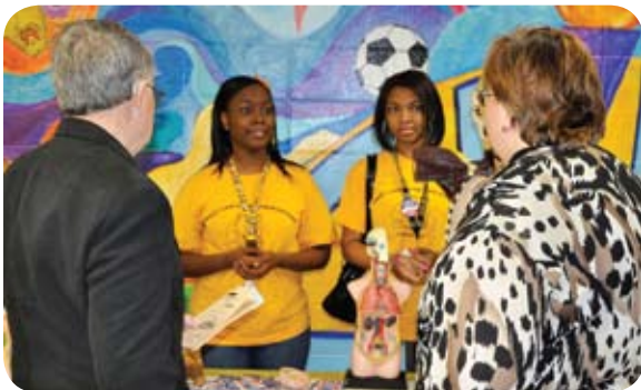
GHS students provide information about their SLC Health & Human Services house at the "A Day In The Life At GHS" luncheon, hosted by the Grandview Chamber of Commerce at GHS February 24.

Guests included Chamber members, community leaders, and GC-4 Board of Education members and administration. SLCs are made up of four themed "houses": 1) Engineering Manufacturing Technology, 2) Arts and Communications, 3) Health and Human Services and 4) International Business Management. The focus of SLCs is to unleash student/staff potential through rigor, relevance and relationships.